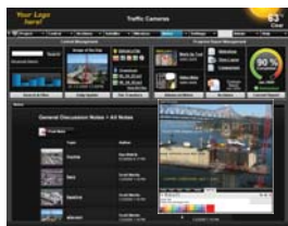
Progress Reports with Mark-Up Tools