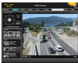
Live Monitoring & Control