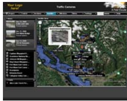
Google Map Navigation