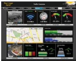
Wireless and Solar Data Center