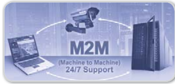
Quality Control and Maintenance