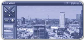
Live Video Preview

Specification includes camera system and managed services