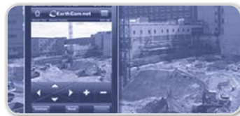
Mobile Device App