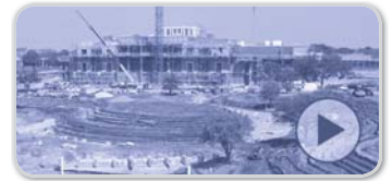
HD Archives and Time-Lapse Movies