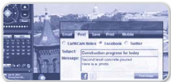
Take and Share On-demand Snapshots