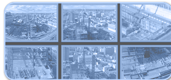
Multiple Preset Archiving