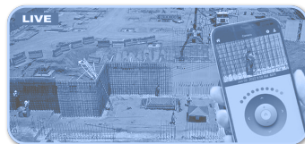
iOS and Android App