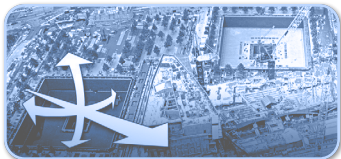
Live Video 360° User Controllable

Specification includes camera system and managed services