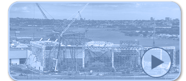
AI-Edited Time-Lapse Videos