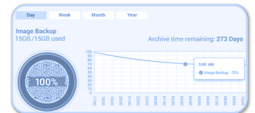
Fail Safe On-Board Backup Storage