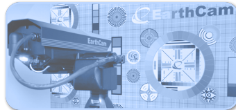
Quality Control and Maintenance