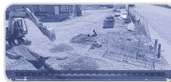
Continuous Video Recording