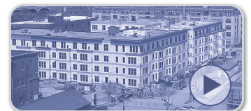
AI-Edited Time-Lapse Videos