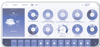
Current and Historical Weather Data