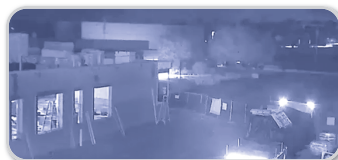
Automatic Day/Night IR mode