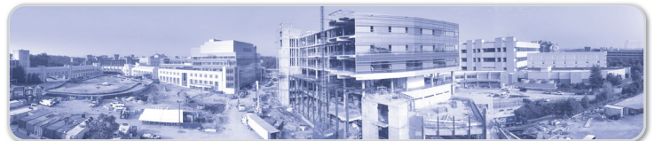
Auto-generated Megapixel Panoramas