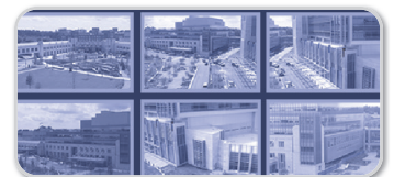
Multiple Preset Archiving