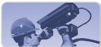
Installation and Maintenance