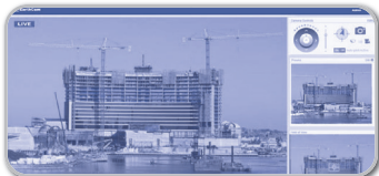
Live Streaming Video

Specification includes camera system and managed services