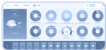
Current and Historical Weather Data