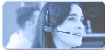
Full Service Support