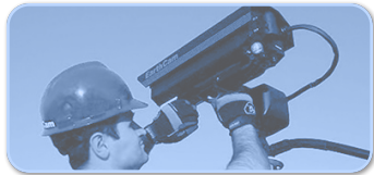
Installation and Maintenance