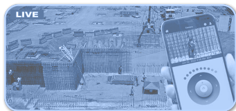
iOS and Android App