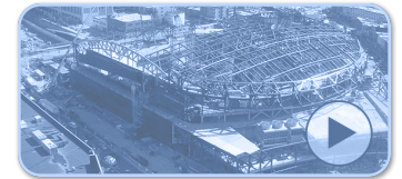
AI-Edited Time-Lapse Videos