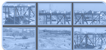
Multiple Preset Archiving