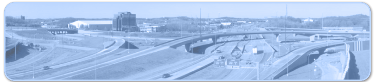
Daily Auto-generated Panoramas