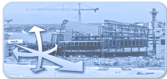
Live Video 360° User Controllable

Specification includes camera system and managed services