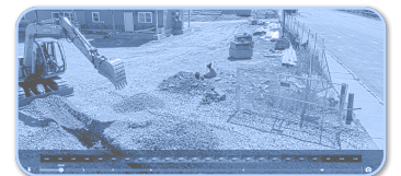
Continuous Video Recording