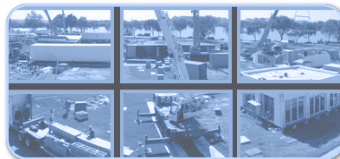
Multiple Preset Archiving