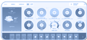
Current and Historical Weather Data