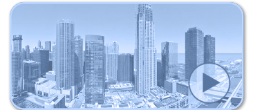
AI-Edited Time-Lapse Videos