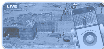
iOS and Android App