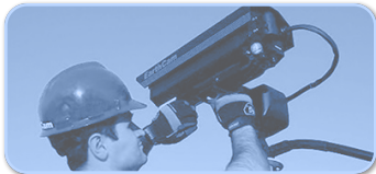
Installation and Maintenance