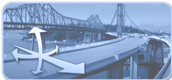
Live Video 360° User Controllable

Specification includes camera system and managed services