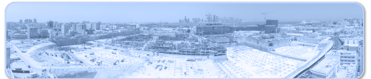
Daily Auto-generated Panoramas