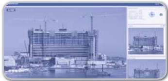
Live Video Preview

Specification includes camera system and managed services