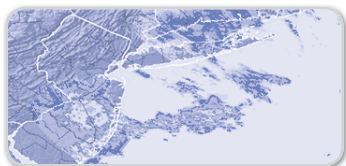
Current and Historical Weather Data