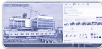
Take and Share On-demand Snapshots