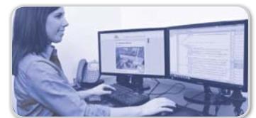
Custom Website Development