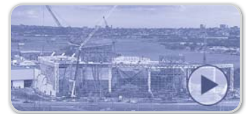
Instant Time-Lapse Movies