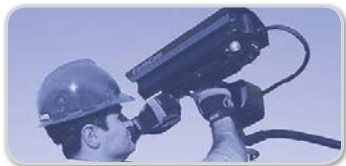
Installation and Maintenance