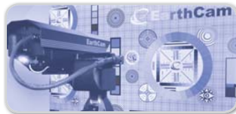
Quality Control and Maintenance