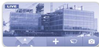
iOS and Android App