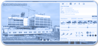
Take and Share On-demand Snapshots