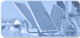
Installation and Maintenance