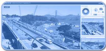
Live Video Preview

Specification includes camera system and managed services