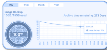
Fail Safe On-Board Backup Storage