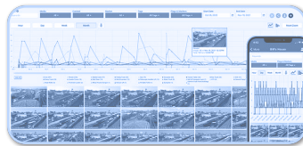
AI Media Dashboard

Low maintenance AGM sealed battery 75 Amp battery charger