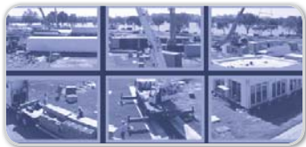
Multiple Preset Archiving