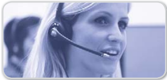
Full Service Support