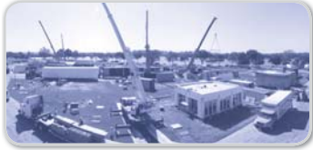
Daily Megapixel Panoramas

Specification includes camera system and managed services