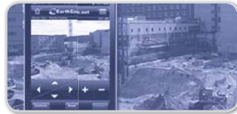
Mobile Device App