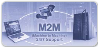
Quality Control and Maintenance