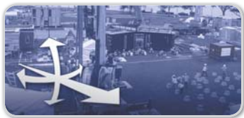
360° User Controllable