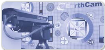
Quality Control and Maintenance