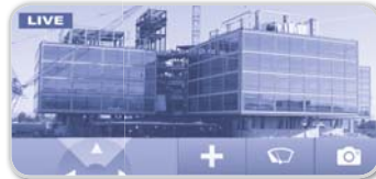
iOS and Android App