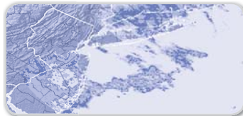
Current and Historical Weather Data