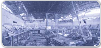
Daily Megapixel Panoramas

Specification includes camera system and managed services