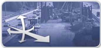
360° User Controllable