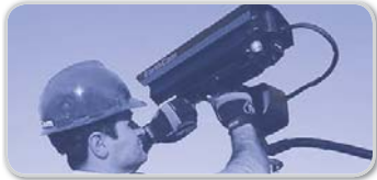
Installation and Maintenance