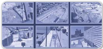
Multiple Preset Archiving