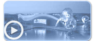
AI-Edited Time-Lapse Videos