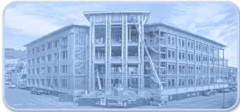
Live Streaming Video

Specification includes camera system and managed services