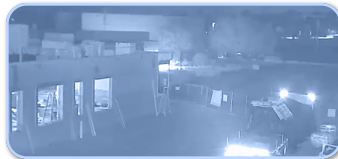
Automatic Day/Night IR mode