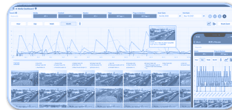
AI Media Dashboard