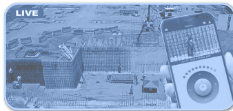
iOS and Android App