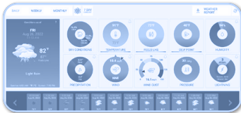
Current and Historical Weather Data