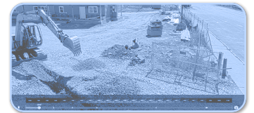
Continuous Video Recording